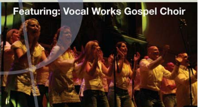
Featuring: Vocal Works Gospel Choir