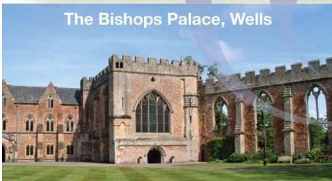
The Bishops Palace, Wells